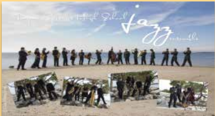
2014 Bands of America National Champions, Indianapolis, Indiana

"Music is a more potent instrument than any other for education, because harmony find its way into the inward places of the soul."