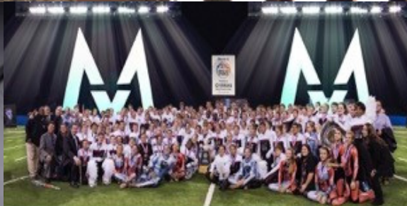
2014 GRAND NATIONAL CHAMPIONS MAN vs MACHINE