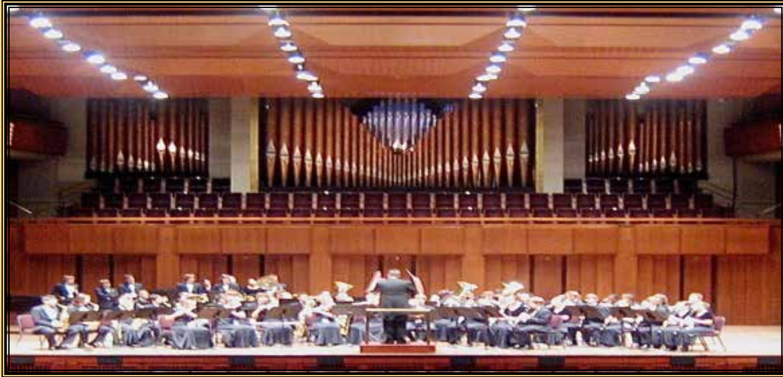
Tarpon Springs High School Wind Ensemble John F. Kennedy Performing Arts Center, Washington DC