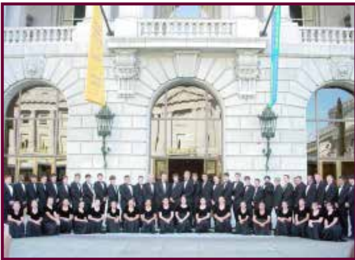
Tarpon Springs High School Leadership Conservatory for the Arts Wind Ensemble